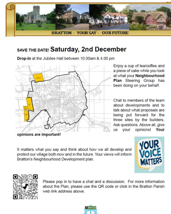
Figure 4 - Sites consultation poster - December 2023