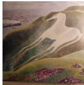
The Westbury White Horse (1939) Train Landscape (1940)

The view to and from the White Horse is depicted in two famous paintings by the war artist, Eric Ravilious (1903-1942)